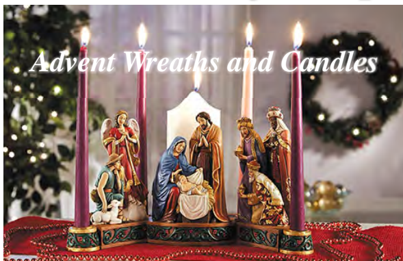
Advent Wreaths and Candles

Our Advent candleholder has a beautiful rendition of the Nativity and is the perfect centerpiece for any home Price $49.95